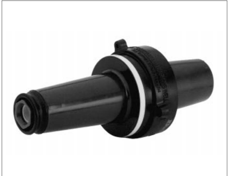
Figure 1. Loadbreak Bushing Insert with latch indicator ring and "All Copper Current Path" for application in transformers, switches and other apparatus.

No special tools are necessary. The insert can be installed by hand or with the assistance of a torque tool. Using the hex-broached base (see Figure 2) and the optional Installation Torque Tool, consistent installation can be easily achieved. Refer to Installation Instruction Sheet S500-12-1 for details.