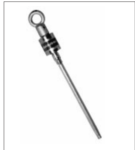
Figure 4. Insert installation torque tool.